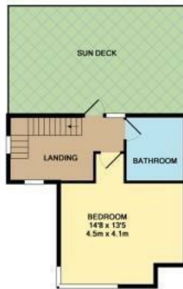
2ND FLOOR APPROX. FLOOR AREA 28.2 SQ.M. (604 SQ.FT.)