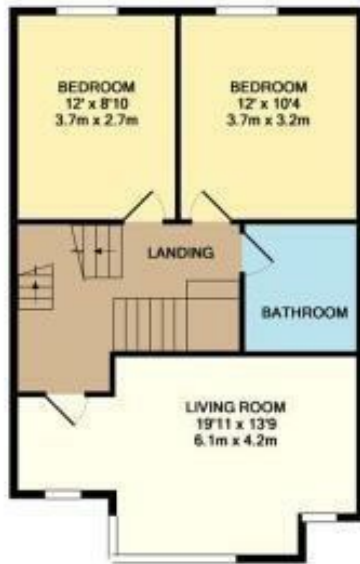
1ST FLOOR APPROX. FLOOR AREA 54.8 SQ.M. (1156 SQ.FT.)